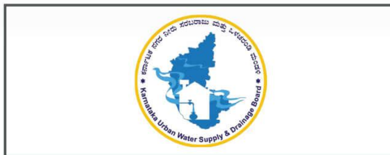
KARNATAKA URBAN WATER SUPPLY AND DRAINAGE BOARD